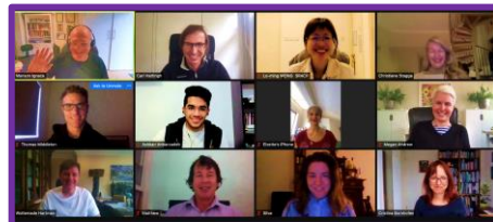
Screenshot of the first group to complete the online EST training with AICHP at the end of 2021.

Regular online group supervision sessions are also scheduled. Contact Corrine at admin@aichp.com.au for more information.